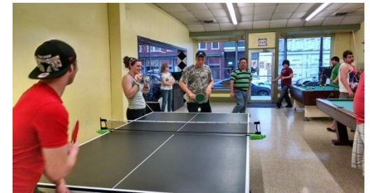
947 N Second Street Chillicothe, Il 61523