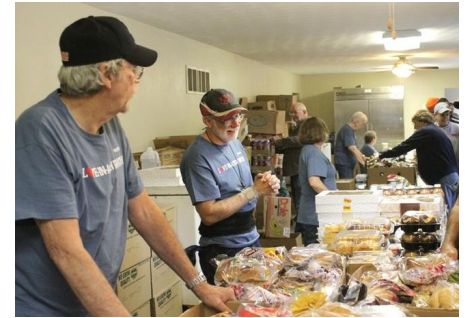
Love in Action Volunteers