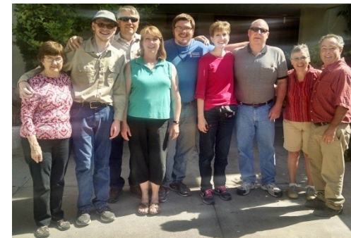
CCC Missions Team